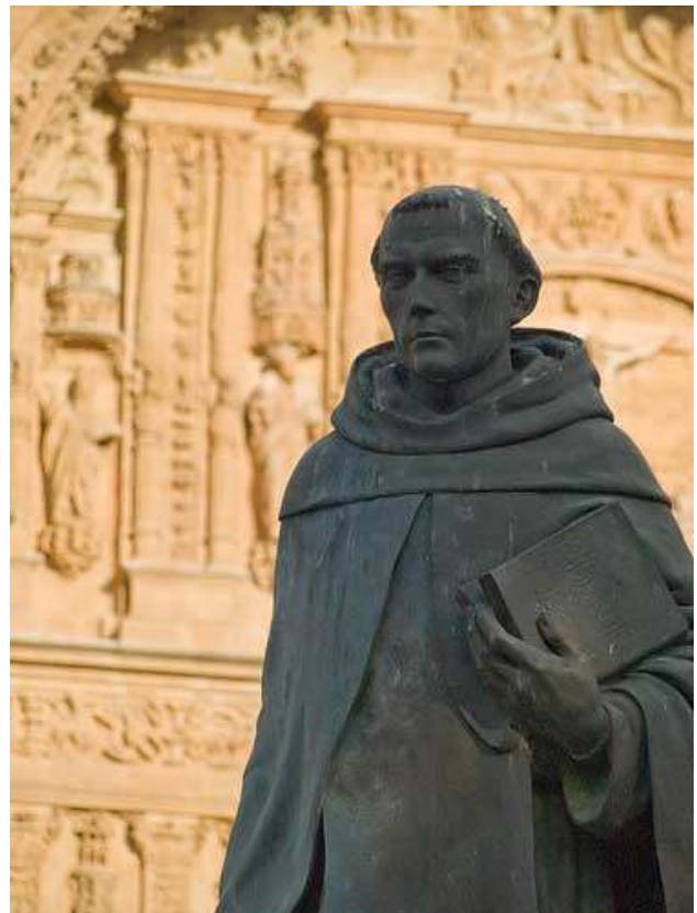
Figure 1 Francis of Vitoria, in the Dominican convento, Salamanca, photo courtesy 'rahengo' Flickr

Around the turn of the 19 th century and into the next, the subject of rights and also of democracy got a bad press among Catholic Church leaders. The reason was that at that time they associated talk of both rights and democracy with the Enlightenment and individualistic political liberalism, which tended to absolutise individual reason and freedom deprived of any relationship with God. 8 As the 20 th century got under way, however, the realisation dawned that it was totalitarianism rather than political liberalism that was the real problem. The growing totalitarianism of the last century showed its face in whittling away or denying many basic human rights, as we saw in communist regimes.